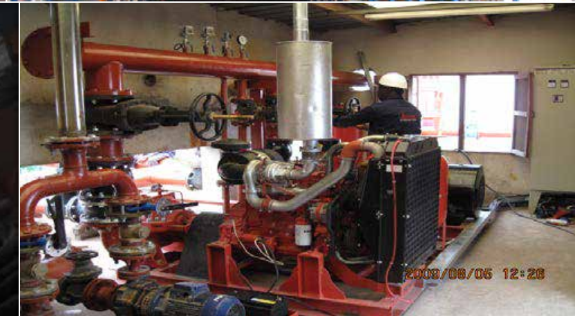
Fabrication Workshop – Mowe, Lagos State