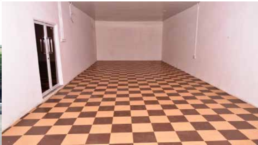
Chemical Solutions Warehouse – Isolo Industrial Area, Lagos State