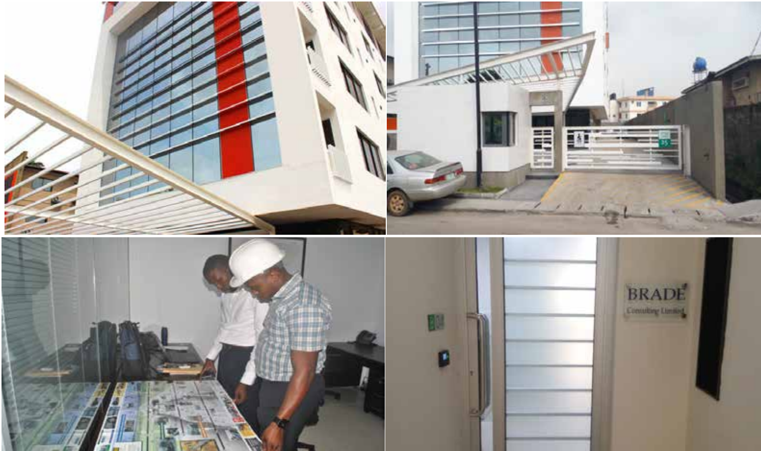
BRADE Group HQ - Ikoyi, Lagos, Nigeria.